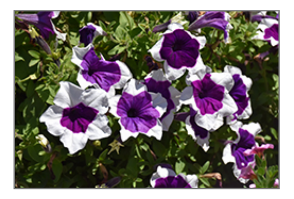
Main Stage Glacier Sky Petunia flowers