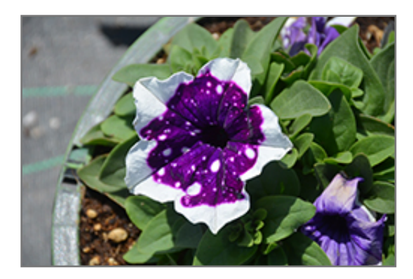
Main Stage Glacier Sky Petunia flowers

Main Stage Glacier Sky Petunia is recommended for the following landscape applications;