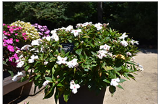
Solarscape White Shimmer Impatiens in bloom

Solarscape White Shimmer Impatiens will grow to be about 9 inches tall at maturity, with a spread of 20 inches. When grown in masses or used as a bedding plant, individual plants should be spaced approximately 14 inches apart. Its foliage tends to remain low and dense right to the ground. This fast-growing annual will normally live for one full growing season, needing replacement the following year.