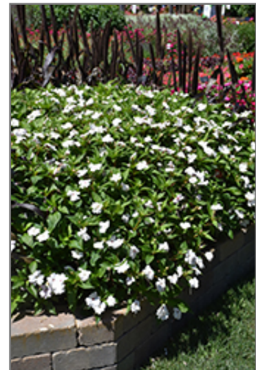
Solarscape White Shimmer Impatiens in bloom