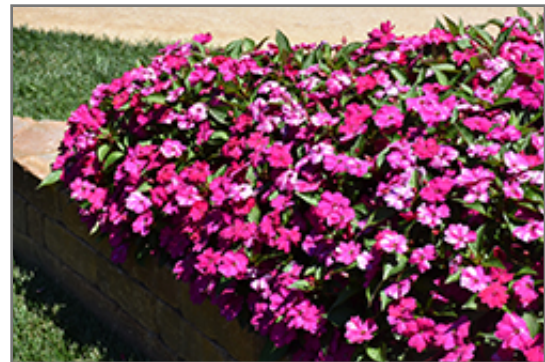
Solarscape Magenta Bliss Impatiens in bloom