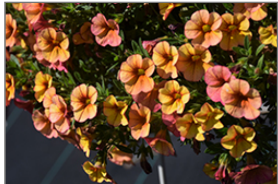
MiniFamous Uno Orange + Red Vein Calibrachoa flowers

This plant will require occasional maintenance and upkeep. Trim off the flower heads after they fade and die to encourage more blooms late into the season. It is a good choice for attracting bees and hummingbirds to your yard, but is not particularly attractive to deer who tend to leave it alone in favor of tastier treats. It has no significant negative characteristics.