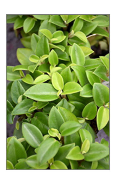
Teardrop Peperomia foliage

When grown indoors, Teardrop Peperomia can be expected to grow to be about 12 inches tall at maturity extending to 16 inches tall with the flowers, with a spread of 24 inches. It grows at a slow rate, and under ideal conditions can be expected to live for approximately 5 years. This houseplant should only be grown away from direct sunlight or in a room with strong artificial light. It is very adaptable to both dry and moist soil, but will not tolerate any standing water. The surface of the soil shouldn't be allowed to dry out completely, and so you should expect to water this plant once and possibly even twice each week. Be aware that your particular watering schedule may vary depending on its location in the room, the pot size, plant size and other conditions; if in doubt, ask one of our experts in the store for advice. It will benefit from a regular feeding with a general-purpose fertilizer with every second or third watering. It is not particular as to soil type or pH; an average potting soil should work just fine.