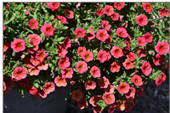
Conga Red Calibrachoa flowers