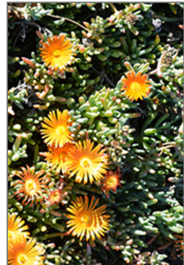
Orange Glow Orange Ice Plant flowers

Orange Glow Orange Ice Plant is recommended for the following landscape applications;