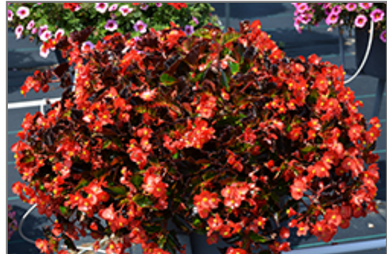
Hula Red Begonia in bloom