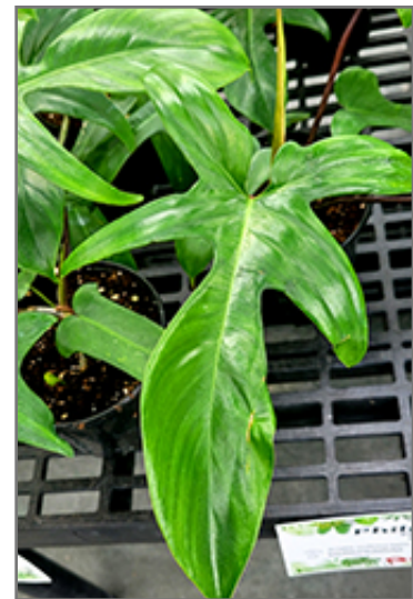
Prismacolor Florida Green Climbing Philodendron foliage