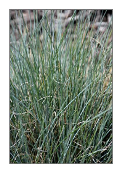
Boulder Blue Fescue foliage