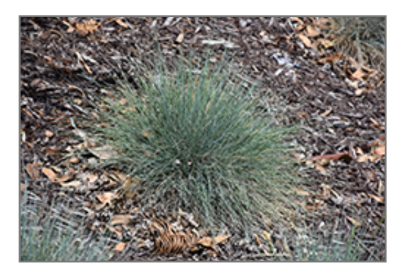
Boulder Blue Fescue