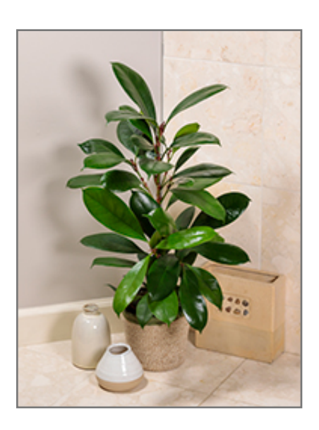
Cyathistipula AfricanFig in full

When grown indoors, Cyathistipula AfricanFig can be expected to grow to be about 6 feet tall at maturity, with a spread of 4 feet. It grows at a medium rate, and under ideal conditions can be expected to live for approximately 20 years. This houseplant performs well in both bright or indirect sunlight and strong artificial light, and can therefore be situated in almost any well-lit room or location. It does best in average to evenly moist soil, but will not tolerate standing water. The surface of the soil shouldn't be allowed to dry out completely, and so you should expect to water this plant once and possibly even twice each week. Be aware that your particular watering schedule may vary depending on its location in the room, the pot size, plant size and other conditions; if in doubt, ask one of our experts in the store for advice. It will benefit from a regular feeding with a general-purpose fertilizer with every second or third watering. It is not particular as to soil type or pH; an average potting soil should work just fine. Be warned that parts of this plant are known to be toxic to humans and animals, so special care should be exercised if growing it around children and pets.