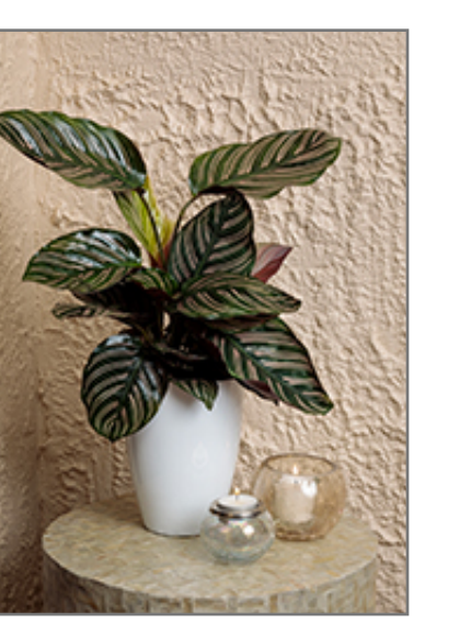
Color Full Sanderiana Pinstripe Calathea in full

When grown indoors, Color Full Sanderiana Pinstripe Calathea can be expected to grow to be about 24 inches tall at maturity, with a spread of 24 inches. It grows at a slow rate, and under ideal conditions can be expected to live for approximately 5 years. This houseplant performs well in both bright or indirect sunlight and strong artificial light, and can therefore be situated in almost any well-lit room or location. It does best in average to evenly moist soil, but will not tolerate standing water. The surface of the soil shouldn't be allowed to dry out completely, and so you should expect to water this plant once and possibly even twice each week. Be aware that your particular watering schedule may vary depending on its location in the room, the pot size, plant size and other conditions; if in doubt, ask one of our experts in the store for advice. It will benefit from a regular feeding with a general-purpose fertilizer with every second or third watering. It is not particular as to soil pH, but grows best in rich soil. Contact the store for specific recommendations on pre-mixed potting soil for this plant.