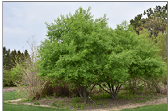
Prairie Radiance Winterberry Euonymus