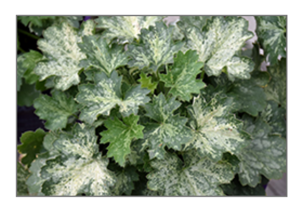
Dew Drops Coral Bells foliage