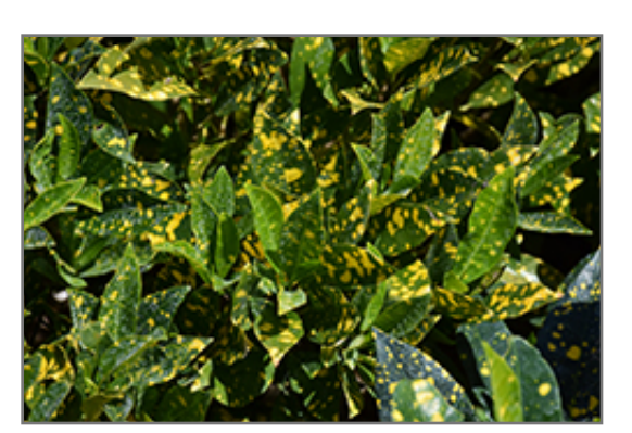
Eleanor Roosevelt Variegated Croton foliage