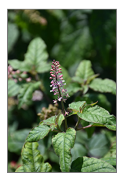
Bloodberry flowers

8546 Sun Valley Road Anytown, USA 12345 204.782.4147