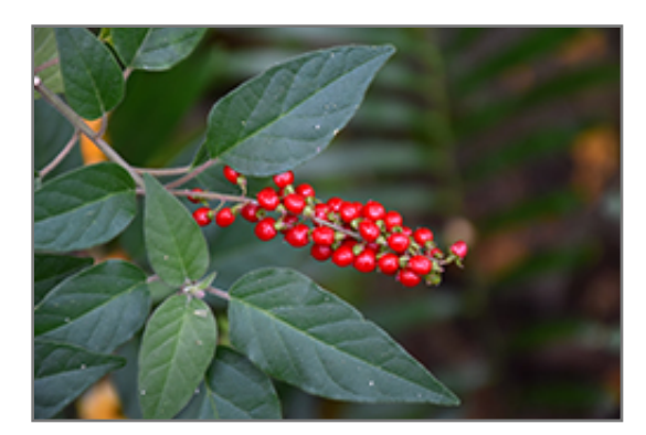
Bloodberry fruit