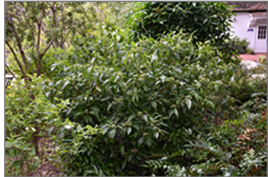
Little Psycho Wild Coffee flowers