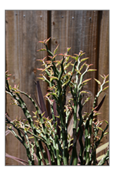
Redbird Flower foliage

When grown indoors, Redbird Flower can be expected to grow to be about 24 inches tall at maturity, with a spread of 12 inches. It grows at a medium rate, and under ideal conditions can be expected to live for approximately 10 years. This houseplant will do well in a location that gets either direct or indirect sunlight, although it will usually require a more brightly-lit environment than what artificial indoor lighting alone can provide. It does best in average to evenly moist soil, but will not tolerate standing water. The surface of the soil shouldn't be allowed to dry out completely, and so you should expect to water this plant once and possibly even twice each week. Be aware that your particular watering schedule may vary depending on its location in the room, the pot size, plant size and other conditions; if in doubt, ask one of our experts in the store for advice. It will benefit from a regular feeding with a general-purpose fertilizer with every second or third watering. It is not particular as to soil type or pH; an average potting soil should work just fine. Be warned that parts of this plant are known to be toxic to humans and animals, so special care should be exercised if growing it around children and pets.