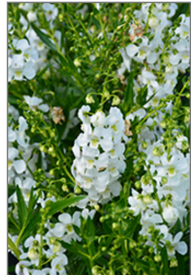
Angelwings White Angelonia flowers

Angelwings White Angelonia is recommended for the following landscape applications;