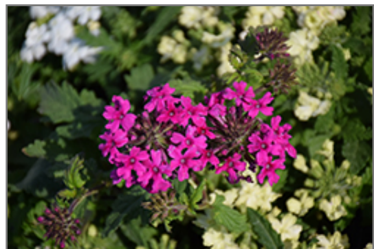
Homestead Hot Pink Verbena flowers