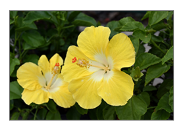
Ronaire Wind Hibiscus flowers

This plant is native to the tropics and prefers growing in moist environments with evenly warm conditions all year round. In our climate, it is usually grown as an outdoor annual in the garden or in a container. If you want it to survive the winter, it can be brought in to the house and provided with special care, and then returned to the garden the following season. In its preferred tropical habitat, it can grow to be around 5 feet tall at maturity, with a spread of 3 feet. However, when grown as an annual or when overwintered indoors, it can be expected to perform differently, and its exact height and spread will depend on many factors; you may wish to consult with our experts as to how it might perform in your specific application and growing conditions.