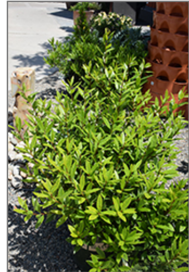
Little Ragu Sweet Bay