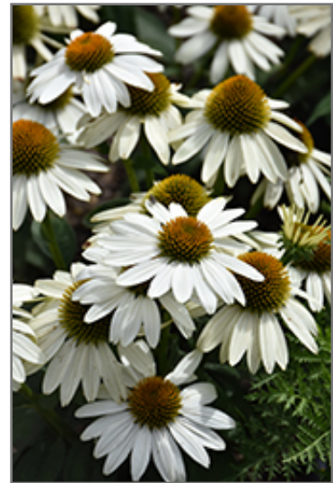
Sombrero Poco White Coneflower flowers

Sombrero Poco White Coneflower is recommended for the following landscape applications;