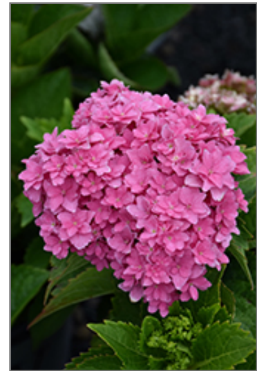
Starfield Hydrangea flowers

Starfield Hydrangea will grow to be about 3 feet tall at maturity, with a spread of 3 feet. It tends to be a little leggy, with a typical clearance of 1 foot from the ground. It grows at a fast rate, and under ideal conditions can be expected to live for approximately 20 years.