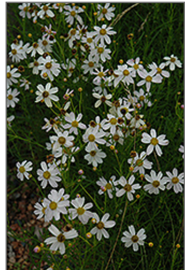
White Alpine Tickseed flowers