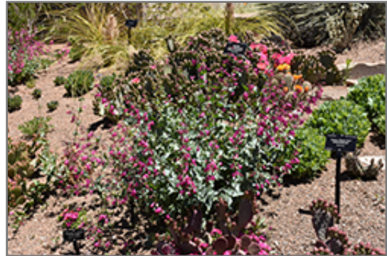
Desert Beard Tongue in bloom