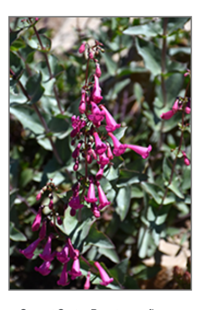
Sunset Crater Penstemon flowers

Sunset Crater Penstemon is recommended for the following landscape applications;