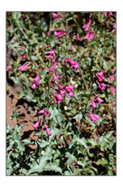
Sunset Crater Penstemon flowers