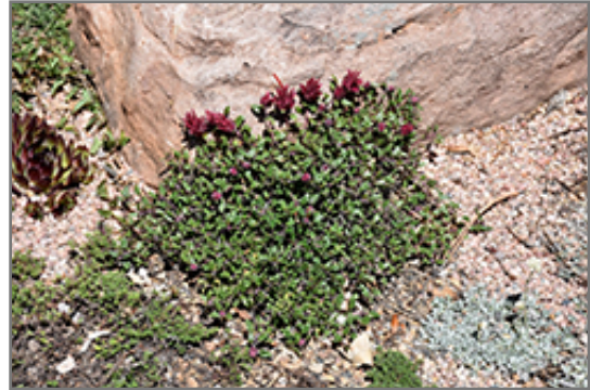
Marian Sampson Scarlet Monardella in bloom

Marian Sampson Scarlet Monardella will grow to be only 3 inches tall at maturity extending to 5 inches tall with the flowers, with a spread of 12 inches. When grown in masses or used as a bedding plant, individual plants should be spaced approximately 8 inches apart. Its foliage tends to remain low and dense right to the ground. It grows at a medium rate, and under ideal conditions can be expected to live for approximately 3 years. As an evergreen perennial, this plant will typically keep its form and foliage year-round.