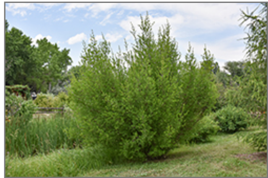
New Mexico Privet