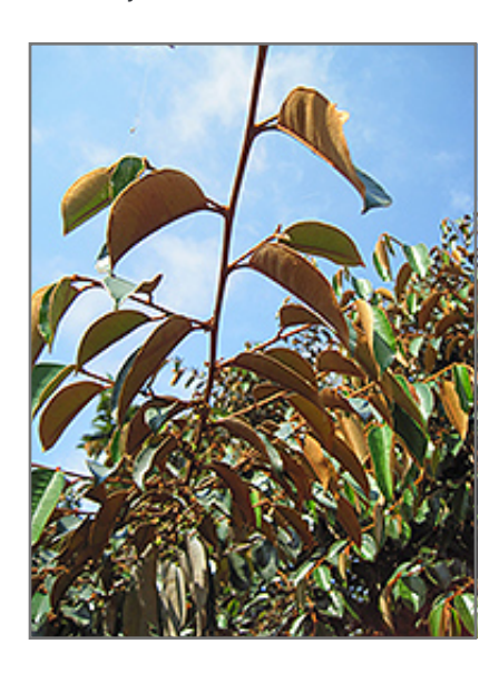
Satinleaf foliage