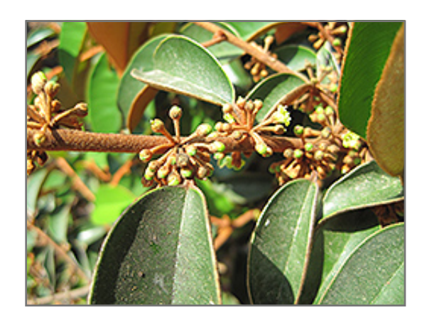
Satinleaf flowers

Satinleaf will grow to be about 30 feet tall at maturity, with a spread of 20 feet. It has a low canopy with a typical clearance of 4 feet from the ground, and should not be planted underneath power lines. It grows at a medium rate, and under ideal conditions can be expected to live for 50 years or more.