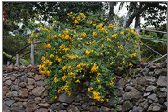
Yellow Marmalade Bush in bloom

Yellow Marmalade Bush is recommended for the following landscape applications;