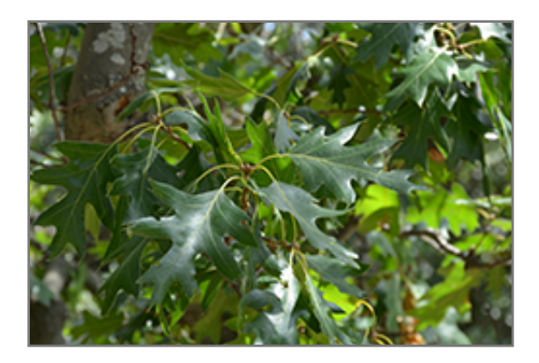
California Black Oak foliage