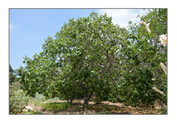
California Black Oak