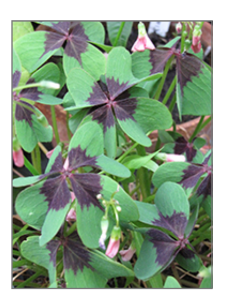
Iron Cross Good Luck Plant foliage

This is a dense herbaceous houseplant with a mounded form. This plant may benefit from an occasional pruning to look its best.