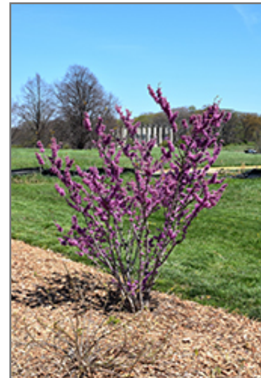
Celestial Plum Redbud in bloom