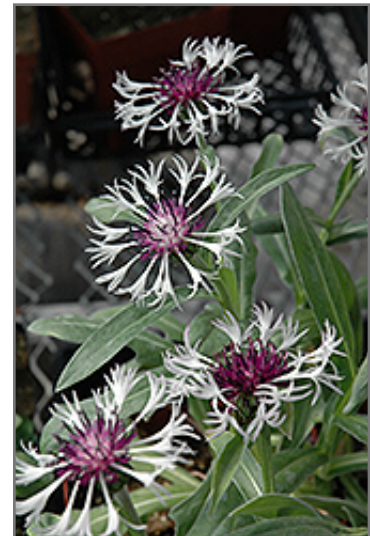
Amethyst In Snow Cornflower flowers

Amethyst In Snow Cornflower is recommended for the following landscape applications;