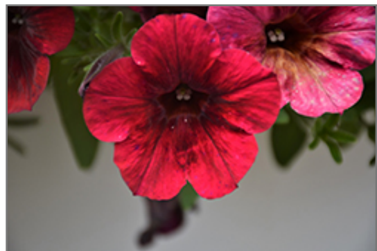
Sweetunia Velveteen Petunia flowers