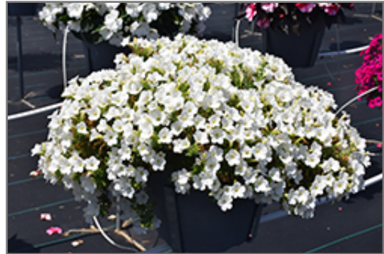
Itsy White Petunia in bloom