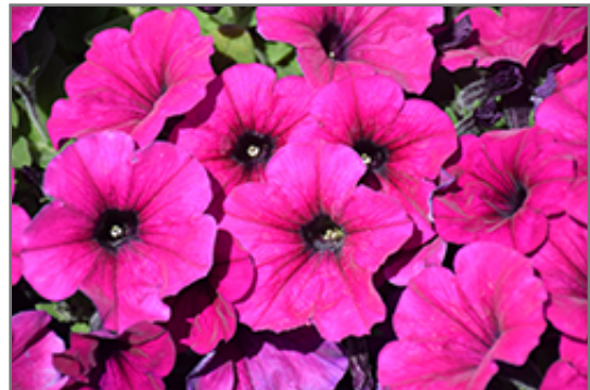
Durabloom Purple Petunia flowers

Durabloom Purple Petunia is recommended for the following landscape applications;