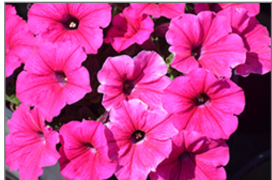
Durabloom Hot Pink Petunia flowers

Durabloom Hot Pink Petunia is recommended for the following landscape applications;