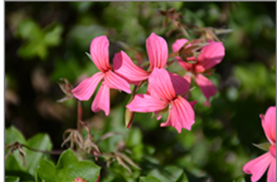
Minicascade Pink Ivy Leaf Geranium flowers

Minicascade Pink Ivy Leaf Geranium is recommended for the following landscape applications;