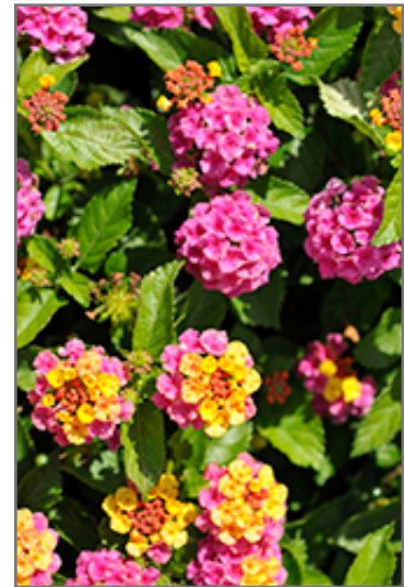
Havana Cherry Lantana flowers

Havana Cherry Lantana is recommended for the following landscape applications;