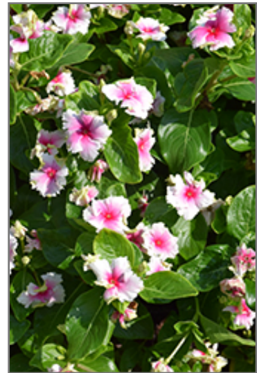
Soiree Flamenco Seniorita Pink Vinca in bloom

This plant will require occasional maintenance and upkeep, and should not require much pruning, except when necessary, such as to remove dieback. It is a good choice for attracting butterflies to your yard, but is not particularly attractive to deer who tend to leave it alone in favor of tastier treats. It has no significant negative characteristics.