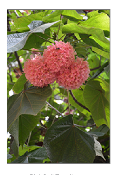
Pink Ball Tree flowers

Pink Ball Tree is recommended for the following landscape applications;