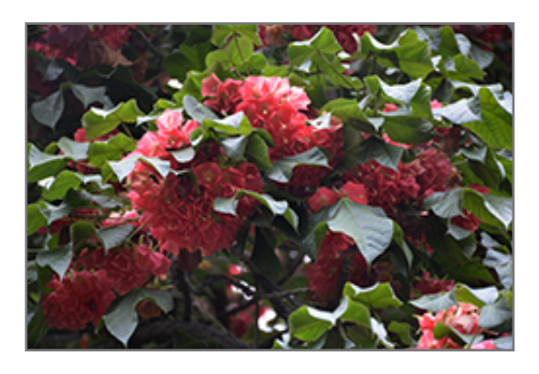
Pink Ball Tree flowers