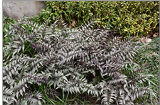
Pewter Lace Painted Fern