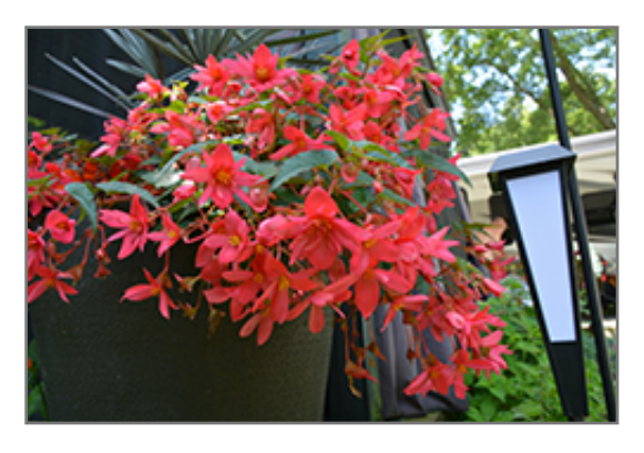
RiseUp Grenadine Red Begonia in bloom