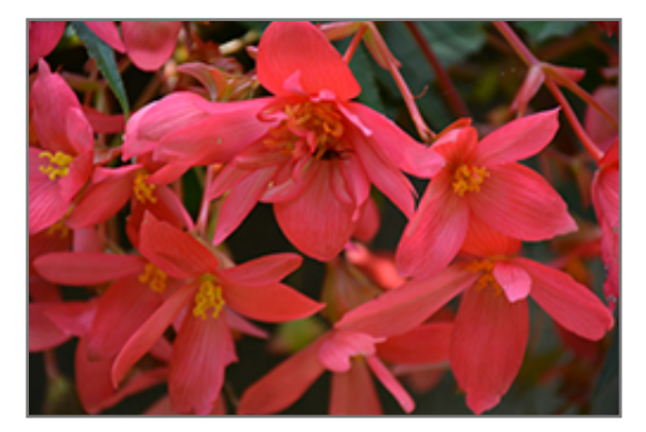
RiseUp Grenadine Red Begonia flowers

RiseUp Grenadine Red Begonia is recommended for the following landscape applications;