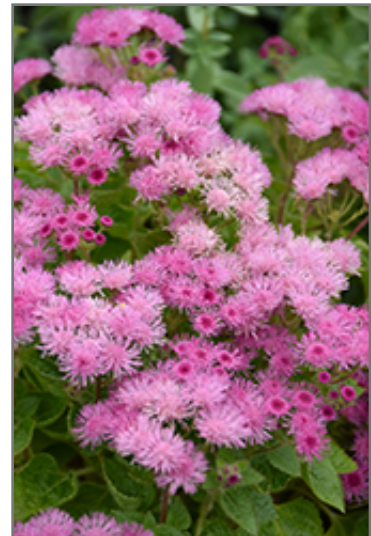
Bumble Rose Flossflower flowers

Bumble Rose Flossflower is recommended for the following landscape applications;