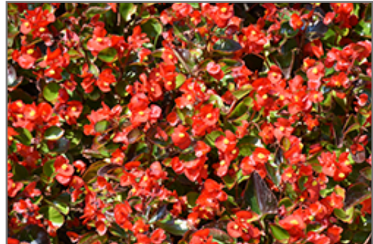
Ambassador Scarlet Begonia flowers