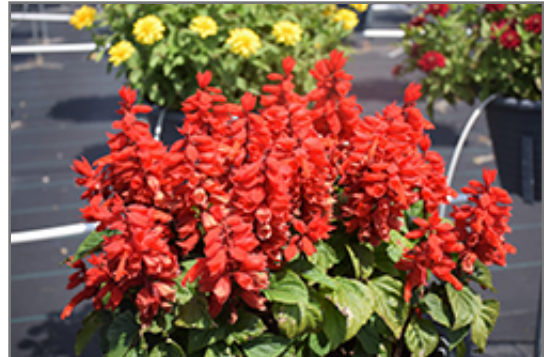
Mojave Red Salvia in bloom