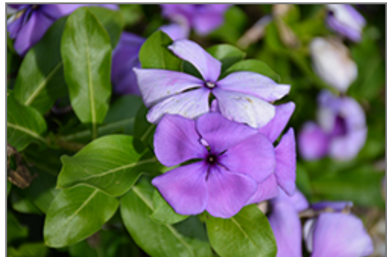
Vitesse Blue Vinca flowers

Vitesse Blue Vinca is recommended for the following landscape applications;