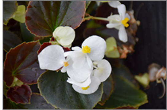
Eureka Bronze Leaf White Begonia flowers